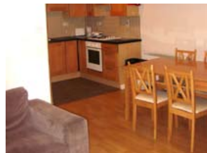
Communal living area