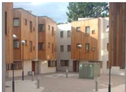
The courtyard of Archway Court