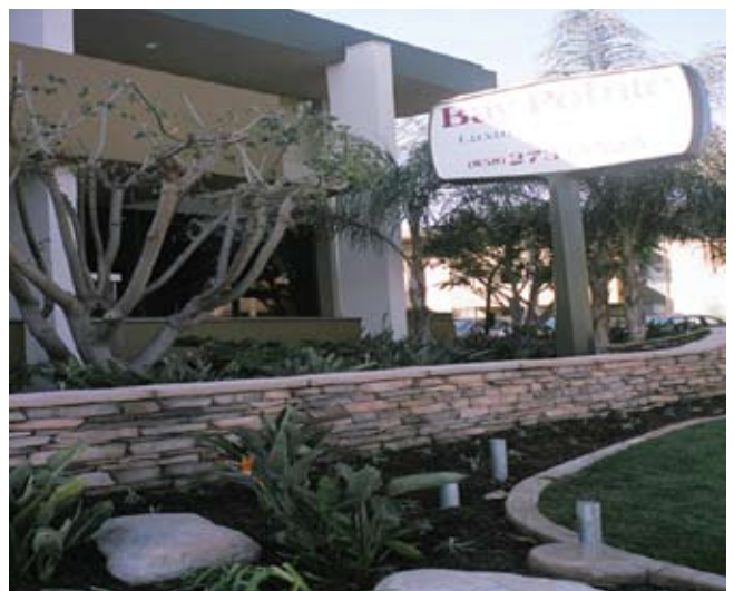
Exterior of Bay Pointe

Bay Pointe Apartments 3366 Ingraham Street San Diego, CA 92109 USA