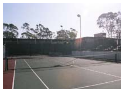
Complex Tennis court