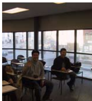
Kaplan Aspect students in the classroom

Because of Boston's rich cultural history, there are many specific events in Boston for our students to enjoy. In the summertime there are free classical music concerts outside at the Hatchshell and free Shakespearean plays on Boston Common, and no one can visit Boston and not see the Red Sox play at Fenway park. The Kaplan Aspect school also organises a varied social programme with activities such as movie nights, meals at American restaurants, reduced pricing or free tickets to museums, theatres, and shows, an international boat cruise, baseball, basketball and soccer games, book club, potluck dinner, conversation group and pizza parties.