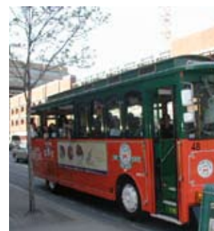
Bus in Boston