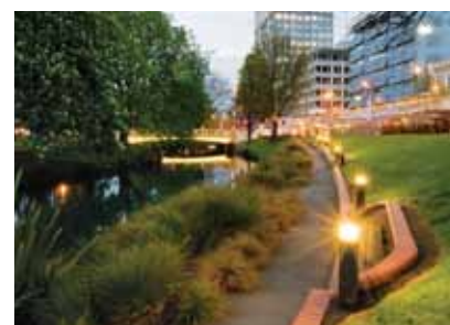
Nearby parks and Avon River