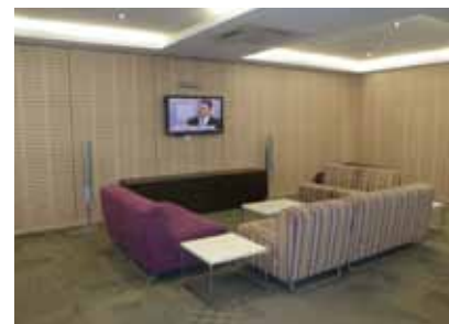
Communal lounge area