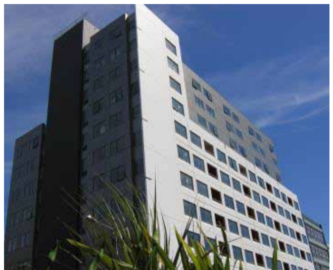
iStay on Cashel

iStay on Cashel Apartments 187 Cashel Street Central City Christchurch 8011 Telephone (03) 968 2200 www.theoaksgroup.co.nz