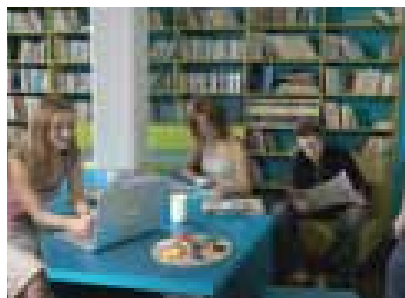
Students in the living area