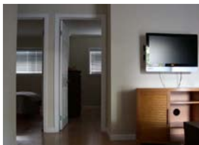
La Brezza interior