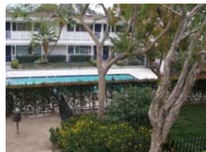
La Brezza exterior