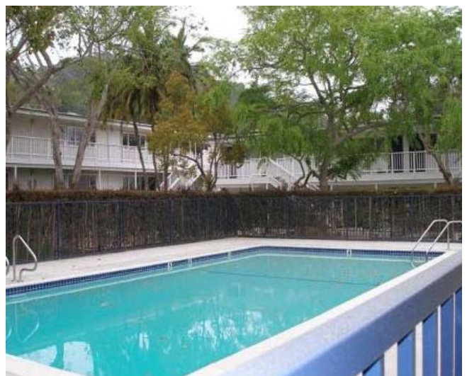
Swimming pool at La Brezza

La Brezza 620 West Gutierrez Street, Santa Barbara, CA 93101 USA