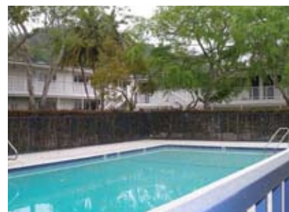
La Brezza swimming pool