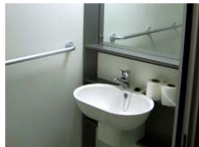
En-suite shower room