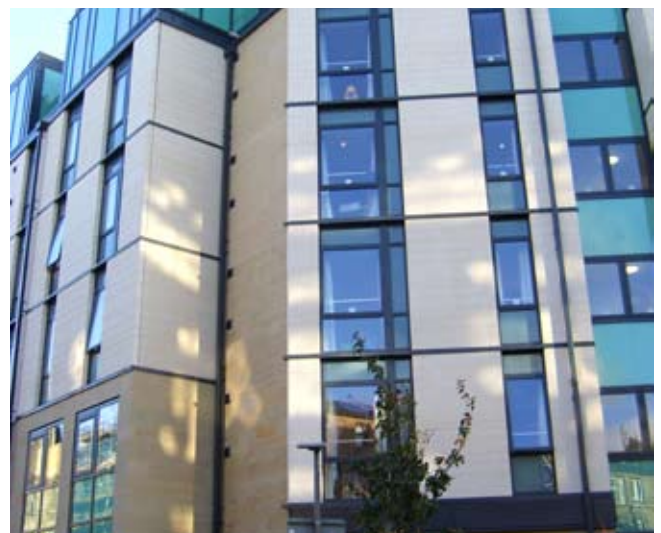
McDonald Road Apartments