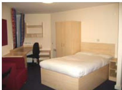
Spacious student bedroom