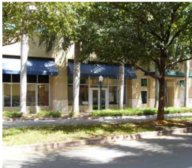
Kaplan Aspect Miami Entrance

Students normally arrive on the weekend and go directly to their housing. If they have not requested transportation, they would either take a cab to their destination or bus and metro rail would be available if they choose. Specific directions will be given to students who ask specific directions when they apply to the school.