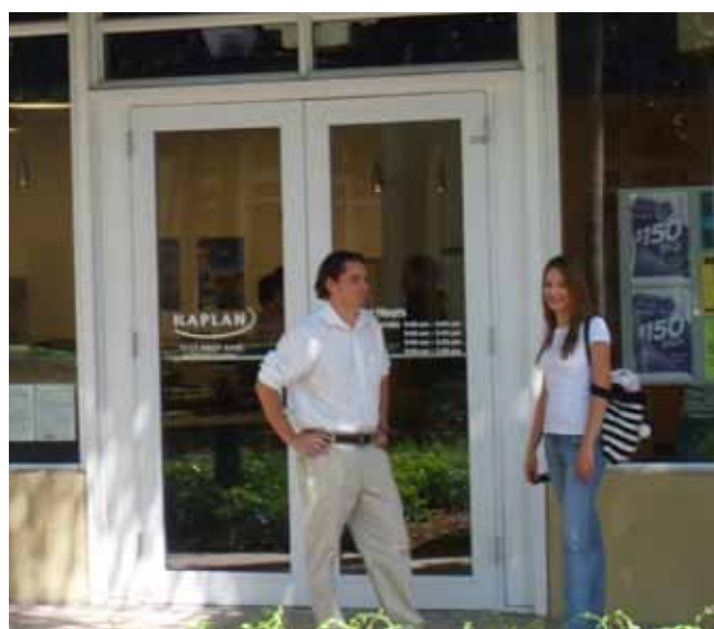
Kaplan Aspect Miami

Kaplan Aspect is a member of AAIIEP (American Association of Intensive English Programs), TESOL (Teachers of English to Speakers of Other Languages) and NAFSA (Association for International Educators).