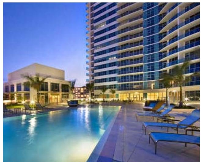
Coral Gables Apartments

Midtown 3301 NE 1st Ave. Miami, FL 33137