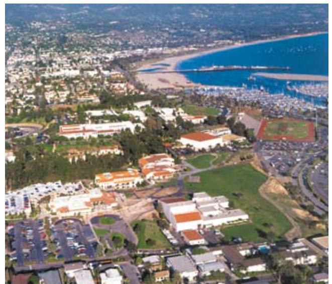
Kaplan Aspect at Santa Barbara City College

Kaplan Aspect is a member of AAIEP (American Association of Intensive English Programmes), TESOL (Teachers of English to Speakers of Other Languages) and NAFFSA (Association for International Educators).