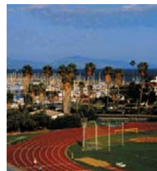
Santa Barbara City College running track