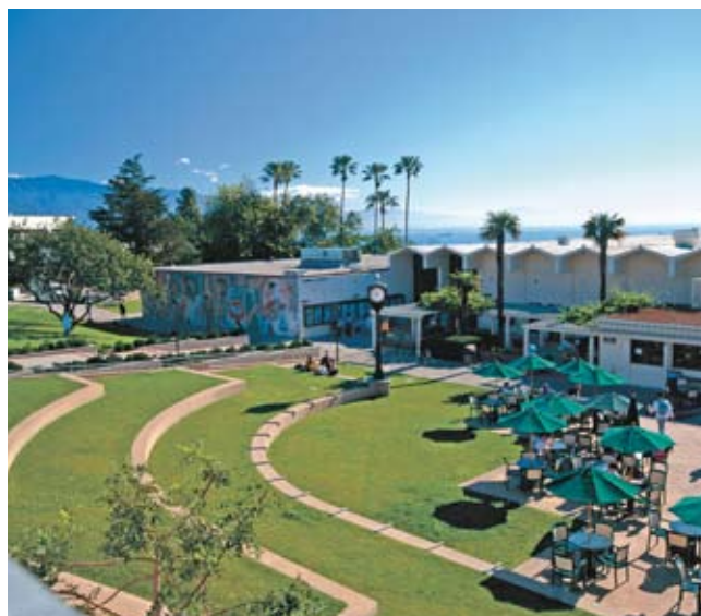
Santa Barbara City College campus

If arriving at Los Angeles International Airport, you can book the Santa Barbara Airbus ( www.sbairbus.com ) for $42 one-way, and then take a taxi from the bus stop to your homestay (approximately $20-$40).