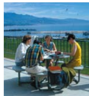
View from SBCC balcony