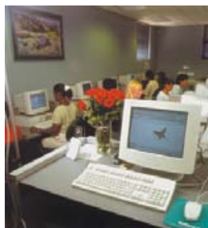
Kaplan Aspect multimedia room

Kaplan Aspect arranges a full schedule of excursions and activities including weekend trips to Las Vegas, San Francisco and Yosemite. There are also days at Universal Studios, Disneyland and the local vineyards.