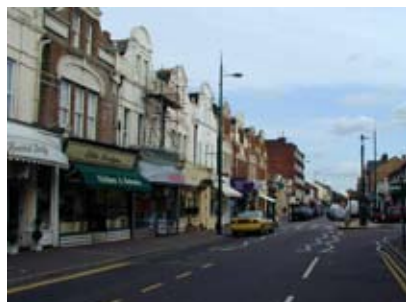
The seaside town of Bournemouth