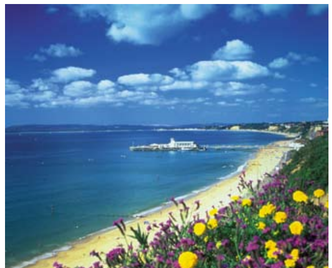
Sandy beaches of Bournemouth

Seamoor Apartments 11A Seamoor Road Westbourne Bournemouth BH4 9AA United Kingdom