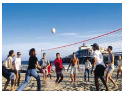
Students playing volleyball on a nearby beach