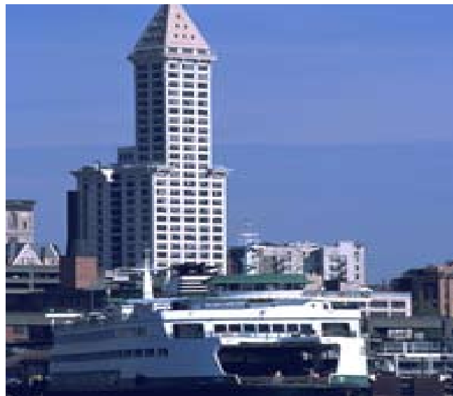
Ferry and Smith Tower

To get to the Seattle Kaplan Aspect from the airport, take bus number 194 to downtown (4th Ave and Jackson) and then transfer to route number 71, 72 or 73 going to the University District. The bus route will take you directly to the Kaplan Aspect School at 4216 University Way NE. You can also pay for a cab from the airport to the school or to your accommodation.