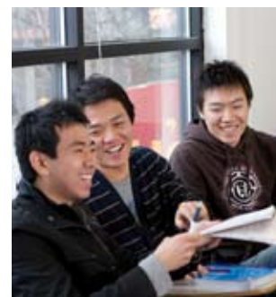
Kaplan Aspect students