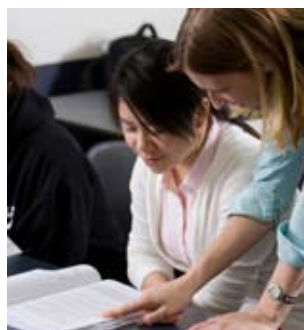
Kaplan Aspect Teacher with students