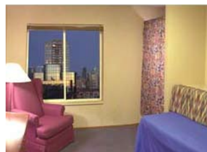
Vermont Inn room