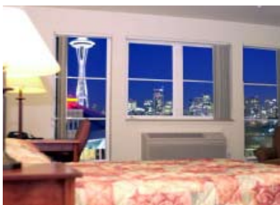
Mediterranean Inn room