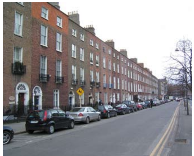
Baggot Street Lower

Kaplan Aspect Dublin City Centre residence YWCA 64 Baggot Street Lower Dublin 2 Ireland