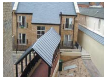
Attractive garden area