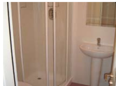
Modern and clean en-suite bathroom