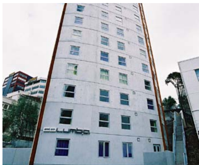
Columbia Student Apartments

Columbia 15 Whitaker Place Auckland City New Zealand Tel: 0064-9-950-8600 Website: http://www.columbia.net.nz/