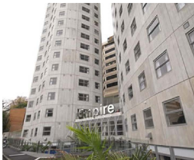
Empire Student Apartments

Empire 21 Whitaker Place Auckland New Zealand Tel: +64-9-950 9000 Website: http://www.empire21.co.nz/