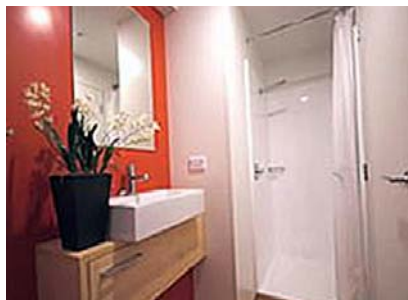
Bathroom in Shared Apartment