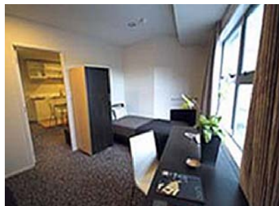
Bedroom in Shared Apartment