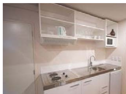
Kitchenette in Shared Apartment