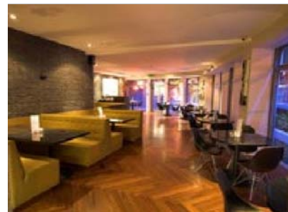
Restaurant and Cafe