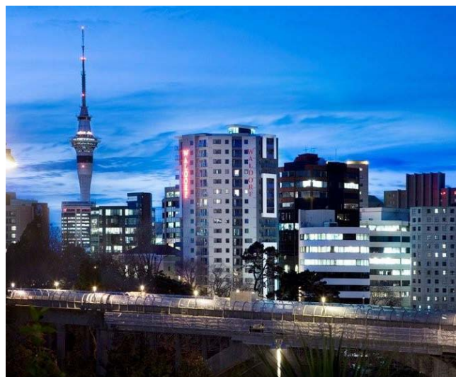
St Martins Waldorf

St Martins Waldorf 6-12 St. Martins Lane Grafton, Auckland City New Zealand Tel: +64 9 337 5300 Website: http://www.st-martins-waldorf.co.nz/