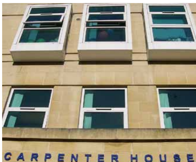
Carpenter House Residence