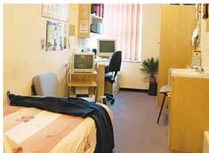
Single bedroom with study facilities