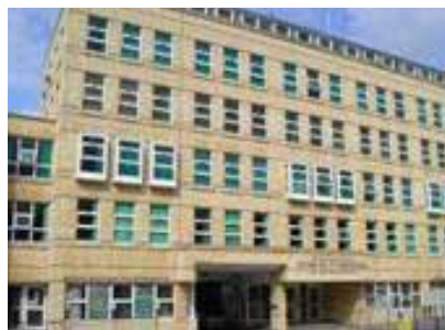
Carpenter House residence