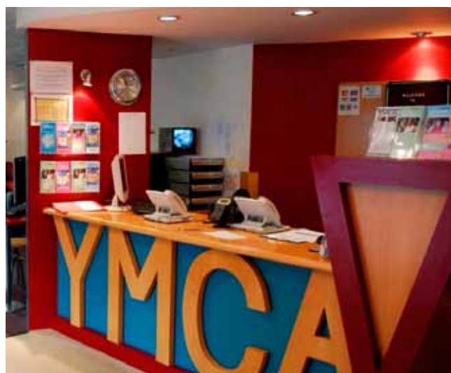
Reception at the YMCA Residence