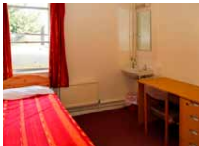
Single bedroom with study facilities