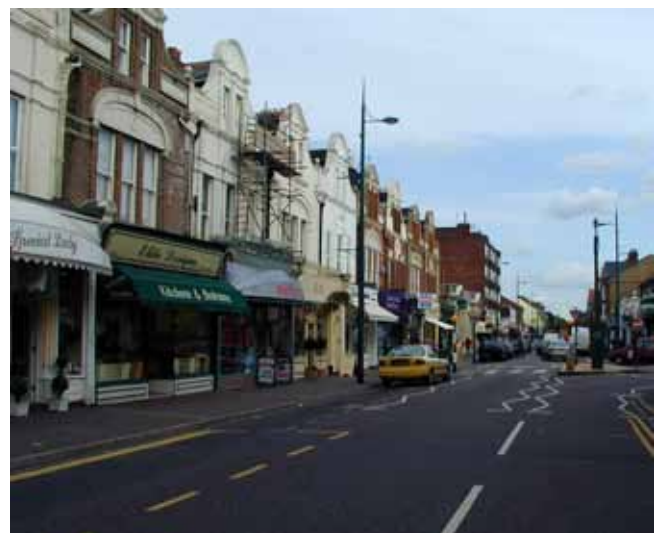
The seaside town of Bournemouth

Bank Apartment 129 Poole Road Westbourne Bournemouth BH4 9BG United Kingdom