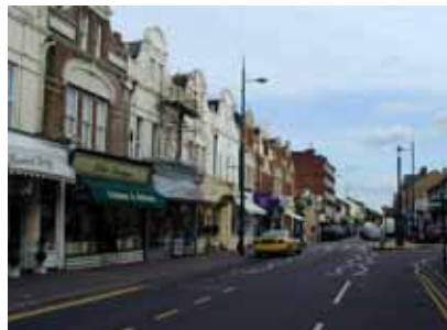
The seaside town of Bournemouth