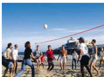
Students enjoying a game of volleyball on Bournemouth beach