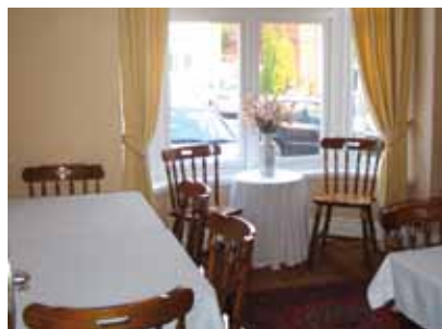
Communal dining room