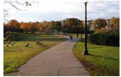
Park opposite ESL Townhouse