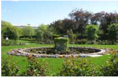
Fenway Rose Garden, opposite the residence