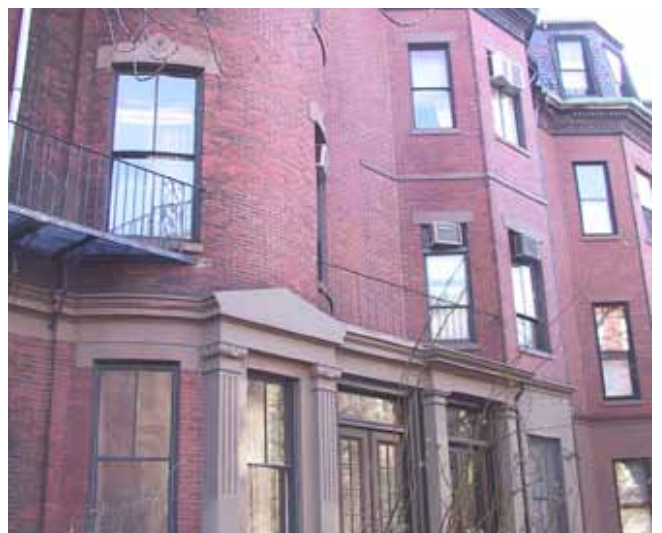
International Guest House

International Guest House 237 Beacon Street Boston, MA 02116 USA