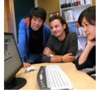
Study centre / library