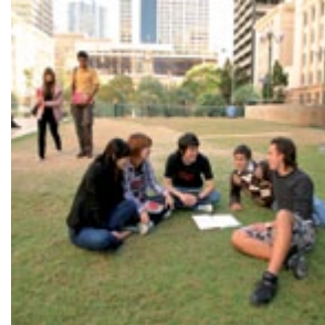
Students in the park