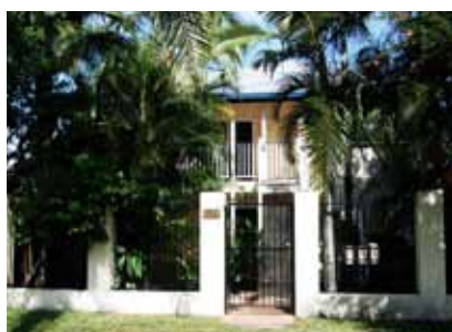
351 Draper Street