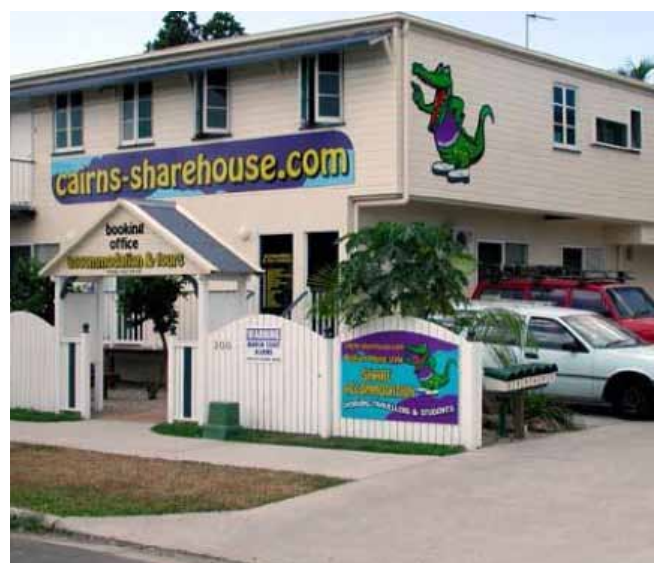
Cairns Sharehouse - 300 Draper Street