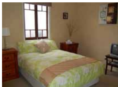
Double Bedroom - Bali House