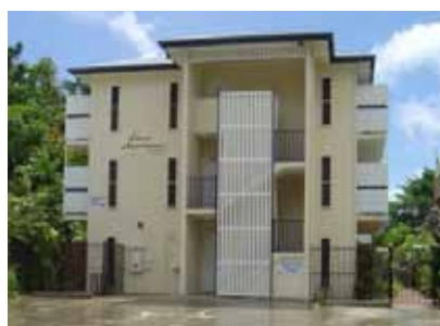
80 Martyn Street