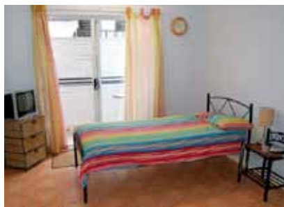
Single Bedroom - 80 Martyn Street