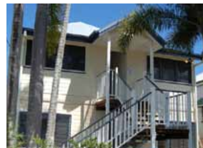
325 Draper Street