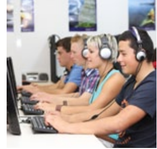
Study centre / library