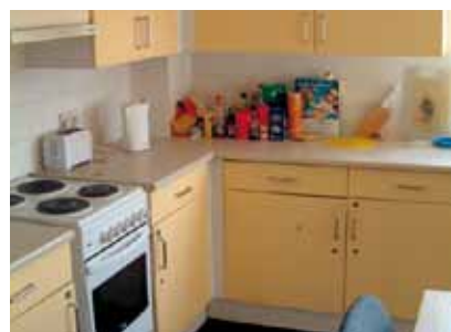
Fully equipped shared kitchen