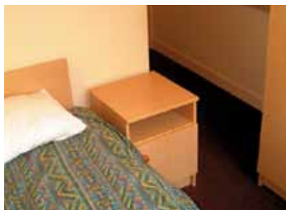
Single study bedroom