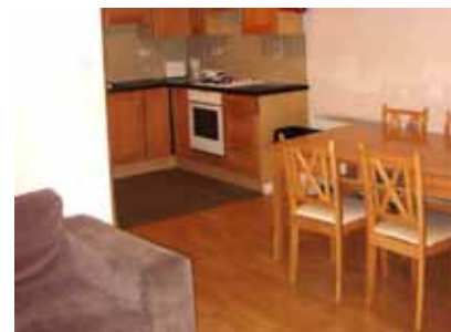
Communal living area