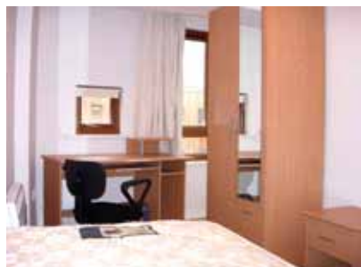
A single bedroom in one of the apartments