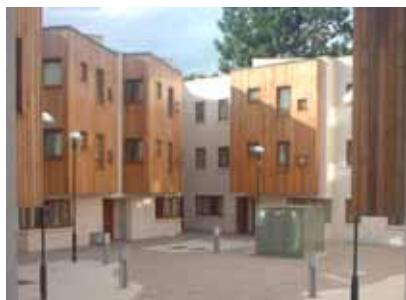
The courtyard of Archway Court