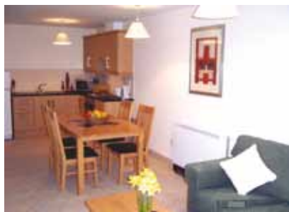
Kitchen and dining room