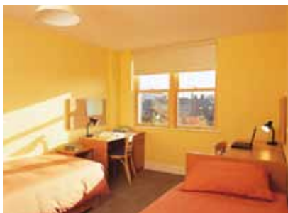
Twin room with study facilities