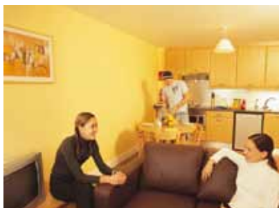
Students enjoying the comfort of their own dining and living room