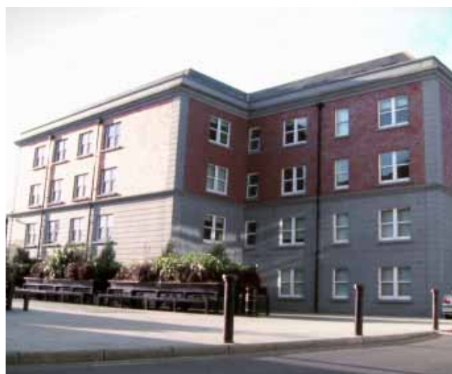
Griffith Halls of Residence