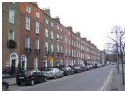
Baggot Street Lower