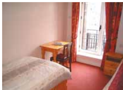
Twin bedroom with study facilities