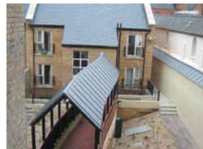
Attractive garden area