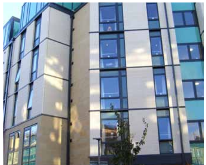
McDonald Road Apartments