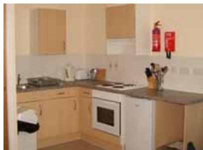
Well-equipped shared kitchen