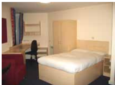
Spacious student bedroom