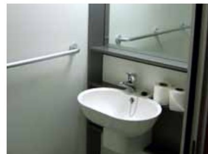
En-suite shower room