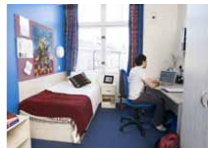
Bedrooms contain a study desk