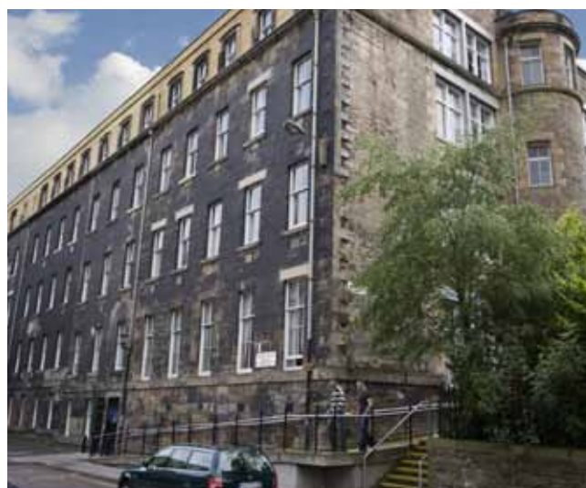
James Craig Court

James Craig Court 27-31 James Craig Walk Edinburgh EH1 3BA