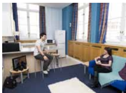
Fully equipped shared kitchen