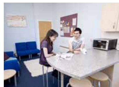
Shared kitchen and living area