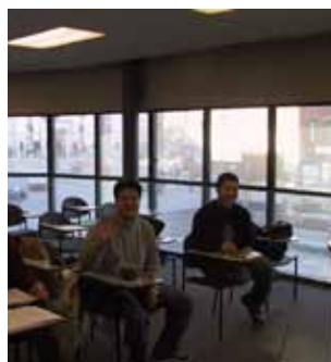
Students in the classroom

Students at the Kaplan Boston Center rave about our activities program, which includes something for all tastes. Among the most popular activities are an evening boat cruise, whale watching trips, soccer games, movie nights, and dinner at local restaurants. Other activities include trips to baseball, basketball, or hockey games, conversation clubs, and trips to different destinations in the Northeast.