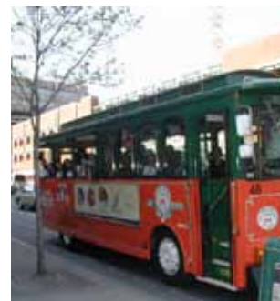
Bus in Boston