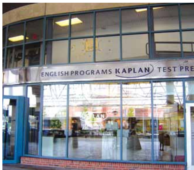
Kaplan International Center Boston

Please note that Kaplan International Centers staff are not at the center on weekends. If you need assistance, please call one of the emergency contact numbers.