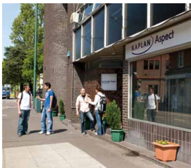
Kaplan International College Bournemouth

The college was built in the 1960s. It is a modern building with three floors and is situated in the area of Westbourne, roughly 5 minutes by bus from Bournemouth town centre. The college is located on a main street and has a lovely patio at the back.