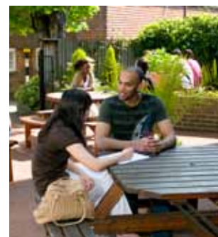
Students in the outdoor patio area