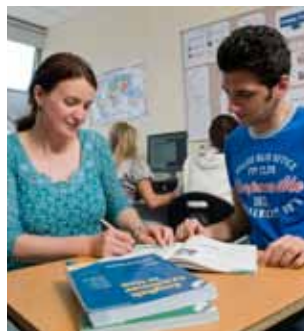
Kaplan teacher and students in a classroom

A full and varied social programme is organised each week. Please see overleaf for an example timetable.