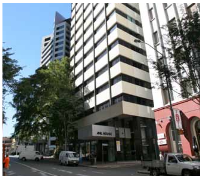
Kaplan International College Brisbane