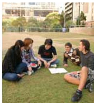
Kaplan International Colleges students