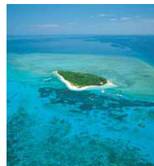
Cairns is a great place for water sports.