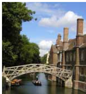
The Mathematical Bridge over the River Cam