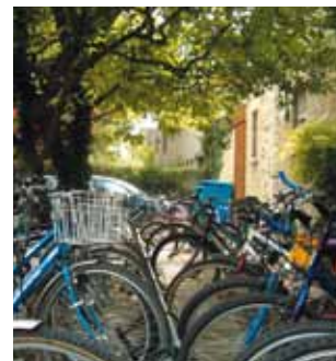
Bikes outside Kaplan International college