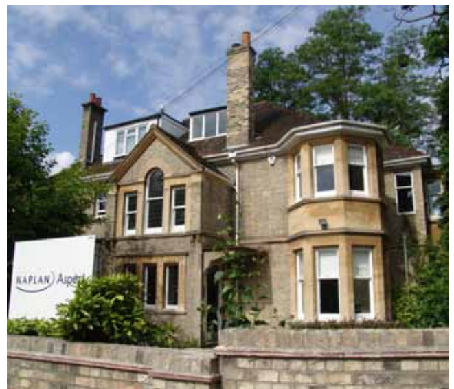
Kaplan International College Cambridge

Founded in the late 1970s, the college is housed in a large, converted Edwardian house with a modern extension. The college is west of the city centre in the quiet, residential area of Newnham, a 10-minute bus ride away from the centre. The college has its own gardens where we hold barbecues on warm summer evenings.