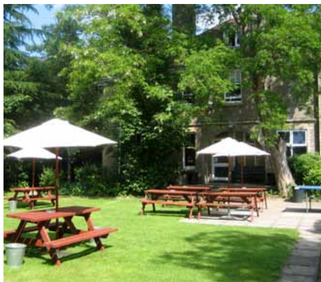
Picnic benches in the college garden

Trains to Cambridge depart from London Kings Cross station and London Liverpool Street every 30 minutes from 06.00 - 23.00. Journey time: 50 minutes.