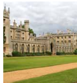
The University of Cambridge - St. John's College