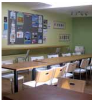
Kaplan International College coffee shop