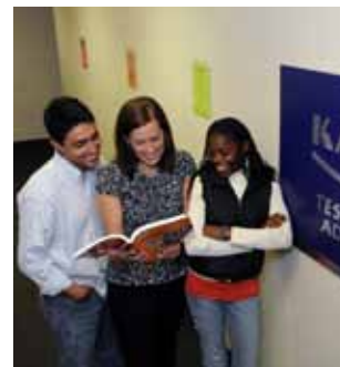
Kaplan International Center teacher and students