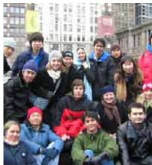
Kaplan International Center students ice skating

Tickets: Movie: $10 CTA Bus: $2.25 CTA Train $2.25 CTA Transfer $0.25