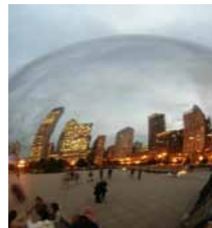
Millennium Park Bean Sculpture