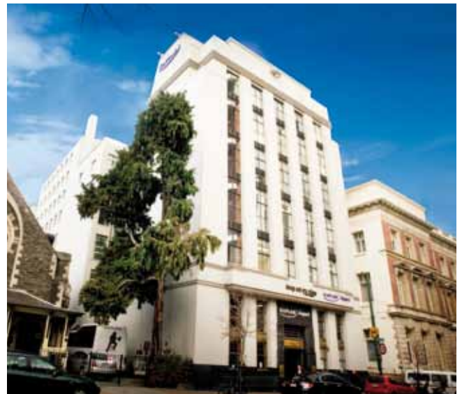
Kaplan International College Christchurch

Kaplan International College Christchurch is ideally situated in the city centre next to Cathedral Square and within a moment's walk from cafes, bars, shops, libraries and central bus routes.