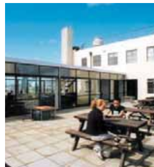
The roof-top café