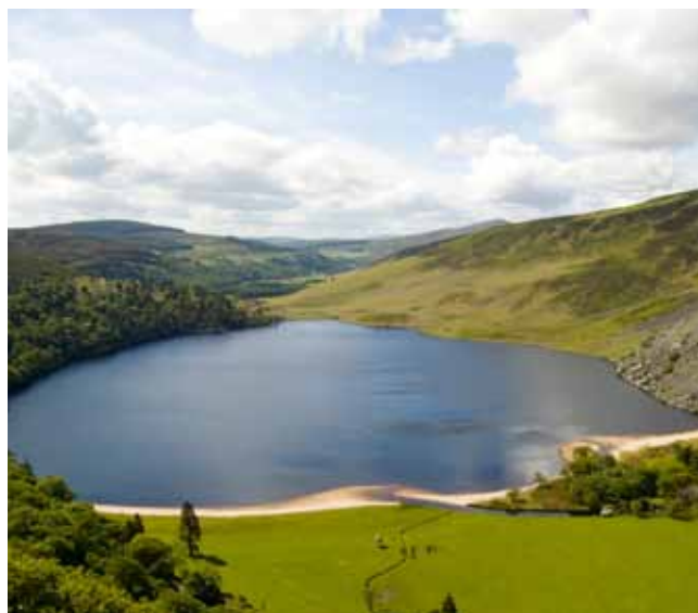
Beautiful Irish countryside