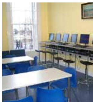
Student common room

A full and varied social programme is organised each week. Please see overleaf for an example timetable.