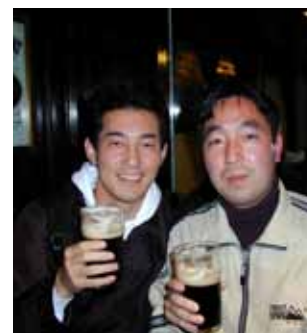
Students enjoying an Irish beer at one of the pubs in Temple Bar