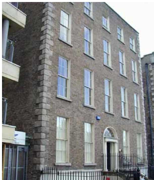
Kaplan International College

The college is housed in a magnificent Georgian building overlooking the River Liffey. The excellent facilities include a large student common room with new flat-screen computers for personal use, a self-study room, a dedicated study room and free wireless Internet access.