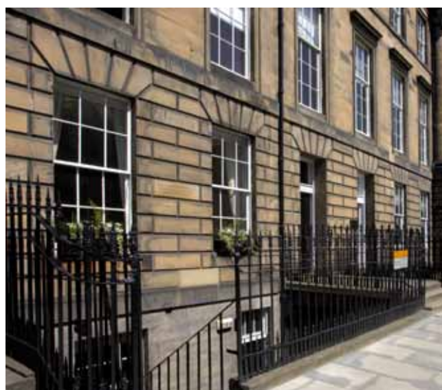
Kaplan International College Edinburgh

The college is in the very heart of Edinburgh, just minutes from the stylish shops of Princes Street and the imposing fortress of Edinburgh Castle. The college is housed in an elegant Georgian building and offers excellent facilities including free wireless internet connection and a multimedia room with the latest language-learning technology.