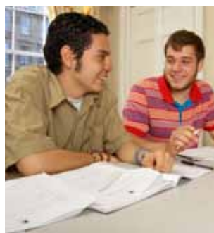
Kaplan students in a classroom

A full and varied social programme is organised each week. Please see overleaf for an example timetable.