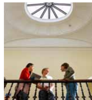
The interior of the college is spacious and bright