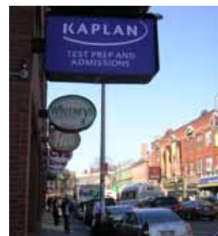
Kaplan International Center Harvard Square Entrance