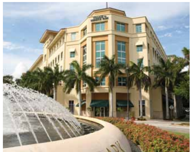
Kaplan International Center Miami

Kaplan International Centers is a member of AAIEP (American Association of Intensive English Programs), TESOL (Teachers of English to Speakers of Other Languages) and NAESA (Association for International Educators).