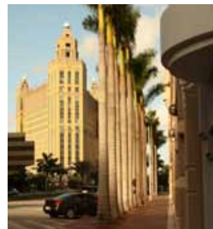
Miami - Coral Gables Area