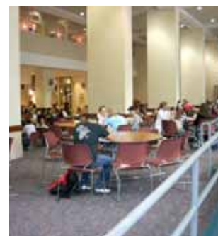
Students at Northeastern