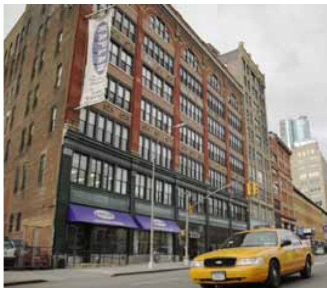
Kaplan International Center NY East Village