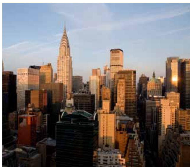
New York skyline

Kaplan International Centers is a member of AAIEP (American Association of Intensive English Programs), TESOL (Teachers of English to Speakers of Other Languages) and NAESA (Association for International Educators).