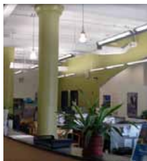
East Village office

While it does not take much imagination to keep yourself busy in New York during the time you're not studying, Kaplan provides a varied calendar of activities to fill your days. With workshops, parties, walking tours, museum trips, sporting events, Broadway shows and more, you'll discover parts of New York you didn't even know existed! These activities are led by a member of the Kaplan staff and will help you to meet new people and discover the city.