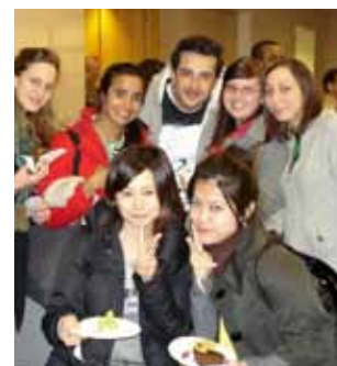
East Village student party