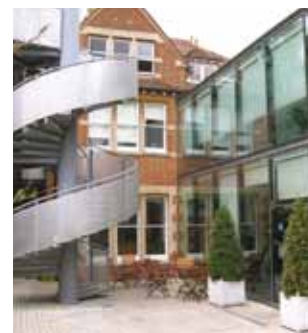
Outside of the college café