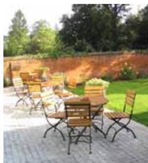
The college garden area