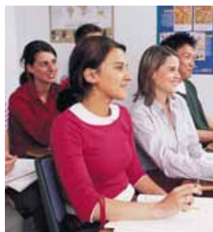
Kaplan students in the classroom

Our full time social organiser helps ensure that students get as much out of their stay in Oxford as possible. We always ask our students to let us know what activities they are interested in to plan the programmes you want!