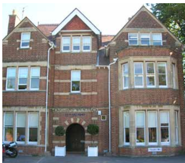
Kaplan International College Oxford

Kaplan International College Oxford is housed in an attractive Edwardian building with 3 floors and a modern, prize winning extension. The college is situated just 10 minutes north of Oxford's city centre and has a beautiful garden and courtyard at the back of the building: the perfect area for summer barbeques and sporting activities.