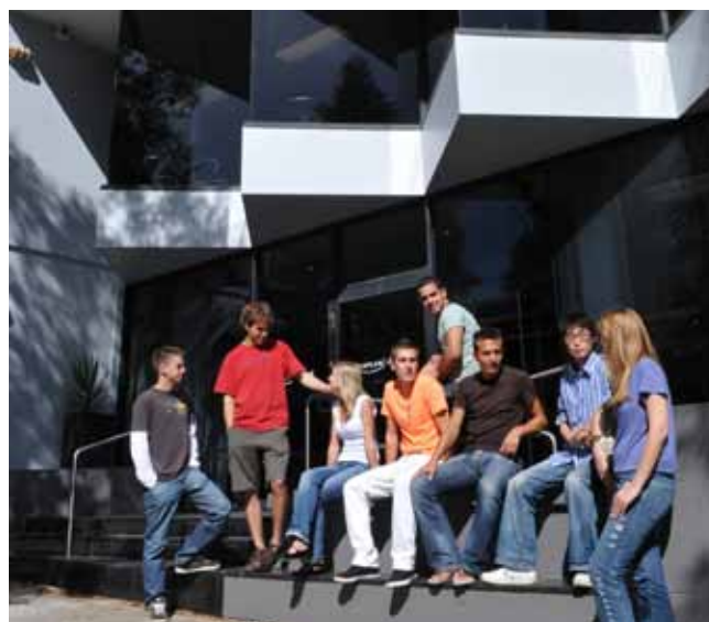
Kaplan International College Perth

Located on the Sunset coast, Perth is loved for its blue skies and white beaches. The city caters to a variety of tastes with its exquisite seafood, bustling street markets and excellent range of shops selling everything from traditional souvenirs through to designer clothes and precious gemstones. You can also expect a very warm welcome from Perth locals who are renowned for their friendliness and hospitality.