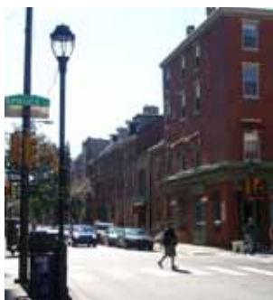
Philadelphia Street Scene