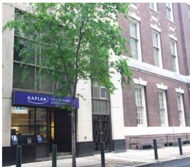
Kaplan International Center

Philadelphia is a diverse city, rich in American heritage and the Arts. Independence Hall and the Liberty Bell are just a few examples of the wonders Philadelphia has to offer students. Boutiques, museums, restaurants, and the diverse culture create a feeling that Philadelphia is home to anyone who visits. Philadelphia is the home of over ten highly competitive universities including the University of Pennsylvania.