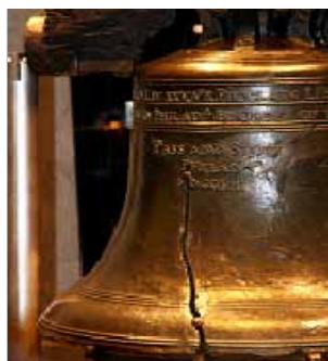
The famous Liberty Bell

Intermezzo café and lounge offers free high-speed Internet access. It is open from 7 am until late. There are also many other internet cafés nearby.