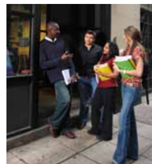
Enjoy a truly international learning environment