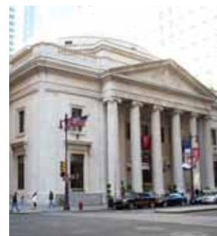
Philadelphia Ritz Carlton